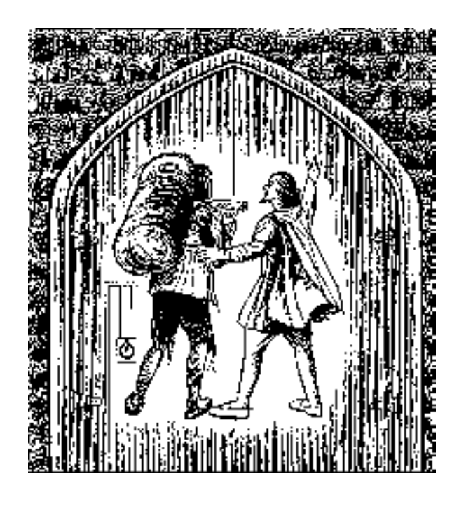
Internet Edition 51 issued November 2004