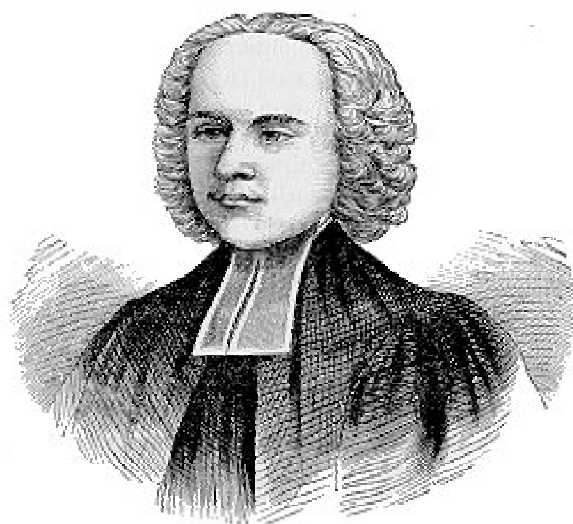
WHITEFIELD AT THE AGE OF TWENTY-FOUR.

It is very remarkable, there are but two sorts of people mentioned in scripture; it does not say the Baptists and the Independents, or the Methodists and Presbyterians; NO, Jesus divides the whole world into but two classes, sheep and goats. The Lord gives us to see which of these classes we belong.