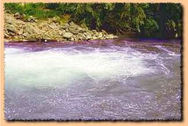
The Jordan River

Down into the water he went; he dipped himself under the water, and when he came up for the seventh time his leprosy had vanished. How glad he was that someone had told him about God's prophet, and how glad the little girl would be, because her master now began to worship the one true God, our Father in Heaven.